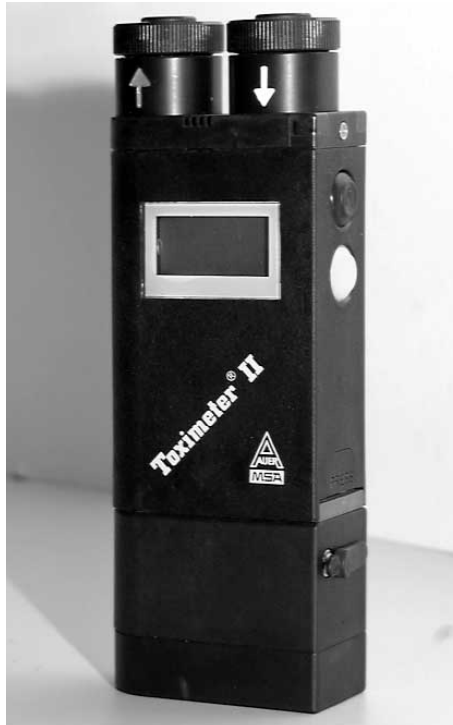
Toximeter™ II Automatic Detector Tube Pump