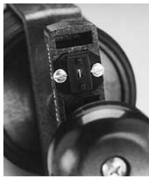
Mechanical stroke counter on both models.