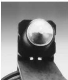
End-of-stroke indicator on Deluxe Model.