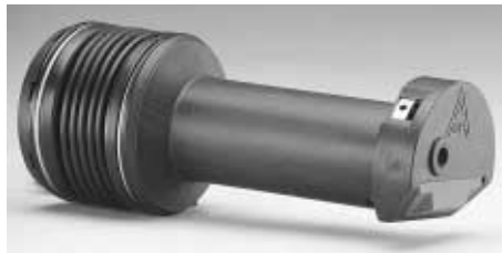
Gas Tester™ II Detector Tube Pump